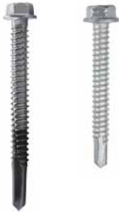
Bi-metallic fasteners are also selectively-hardened. The drill-tip and tapping threads are high-carbon steel, fused to a stainless steel shank (left, before coating). The high-carbon steel is hardened, leaving the shank unaffected. The entire fastener is then covered with corrosion-protective/galvanic barrier coating (right).

Since the Arshat Center was built, the science of selectively-hardened fasteners has continued to advance. First, bi-metallic