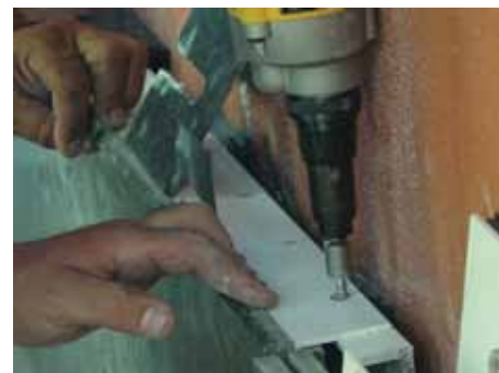
Self-drilling, self-tapping screws install quickly using hand-tools.

Case-hardening has been the most common method used. Low-carbon steel fasteners are heated in a high-carbon environment, infusing carbon into the outer layer of the steel and creating a hardened shell, or case , that is hard enough to drill and tap soft steel. The inner core of the fastener remains softer and more ductile.