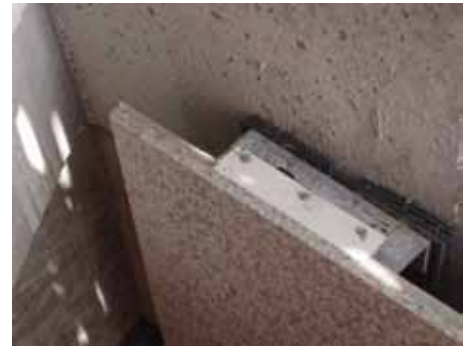
A granite slab is held in place on the exterior of the Arshat Center using a two-part clip assembly.

Under extreme loading situations such as hurricanes, tornadoes, earthquakes, or explosions, the ductility of fasteners becomes a significant issue. These loads are applied impulsively, like a hammer-blow, which can produce a different type of response from gradual or continuous loading in a structural element.